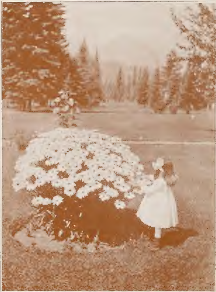
The Shasta Daisy—a Burbank Creation.

The Sugar Prune, though a month earlier, fully four times as productive and more than twice the size of the French Prune, has been often condemned—one of its worst supposed faults being that it produced too much fruit! To-day the tide is rapidly turning in its favor as the growers are realizing its value for drying and its unequaled value for shipping. Eastern retail dealers in fancy fruits like it and write that it is the “best of all sellers,” and some of the wholesale firms have written to growers, “Grow all of Burbank’s Sugar Prune you can; too many of them cannot be grown for the Eastern market.”